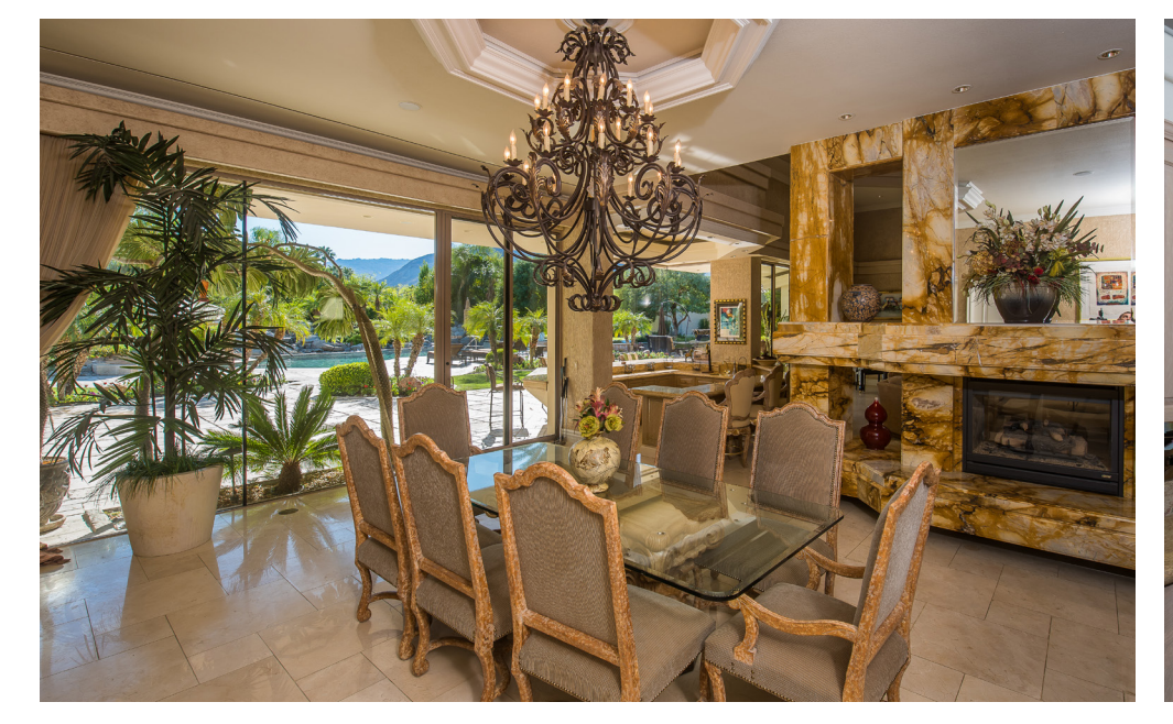
PRICE UPON REQUEST

Magnificent estate compound with over three acres of park like grounds on prestigious Clancy Lane! Six bedrooms, seven and a half baths including guest wing and guest house. Approx. 10,495 sq. ft. Features elegant stone entry bridge over water, living room with marble two sided fireplace to dining room and custom marble sit down wet bar. Gourmet kitchen with center prep/cook island and family room with fireplace, media and breakfast nook. The guest wing has a living room with fireplace, full kitchen and laundry. Guest house has game room and wet bar. Master suite is fit for a king with marble fireplace, media and his and her baths. Resort like pool with large spa, waterfalls and swim up bar. Three hole putting green, sunken tennis court with lights and seating terrace. Every amenity and sensational mountain views! Furnishings are negotiable!